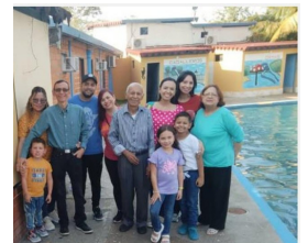
New Group in Pampanito