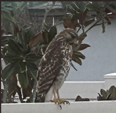
This bird was in my backyard few days ago

Native to South America, this bird is only found in Florida in the United States where its both breeding and wintering. The bird is very dark brown all over the upperparts with a pale underside. It is a secretive bird and thus not a lot is known about its way of life.